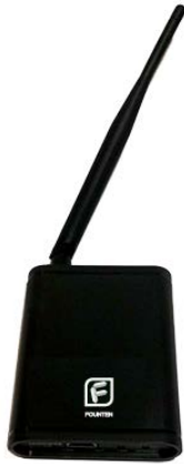
Extended Range Wireless Repeater Part No. FS-Repeater-XR